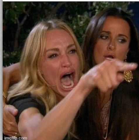
Gov communicator taking the bait and getting frustrated